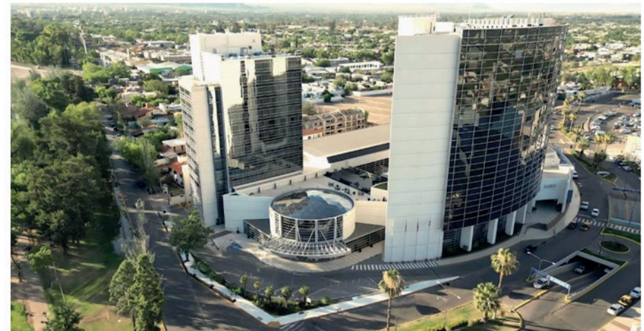
HOTEL HILTON MENDOZA