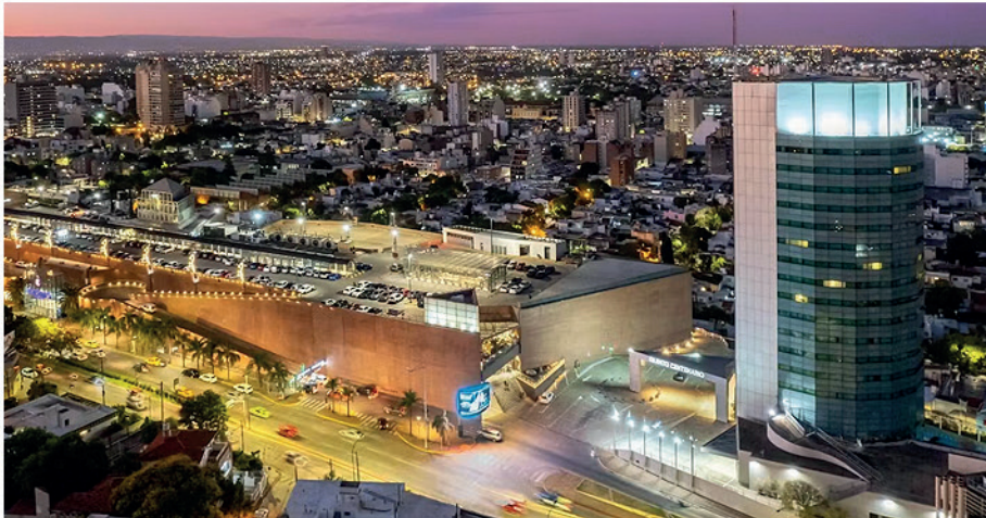
HOTEL QUINTO CENTENARIO